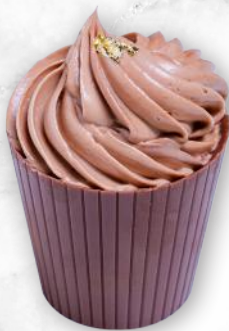
ALUNGA 41% MILK CHOCOLATE MOUSSE