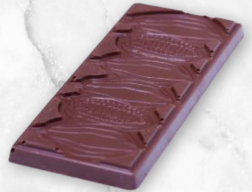
ALUNGA 41% FEUILLETEE MILK CHOCOLATE