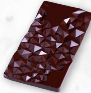
ALMOND RASPBERRY DARK CHOCOLATE