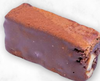
MOIST CHOCOLATE BROWNIE

All prices are subject to 10% service charge and 7% government tax.