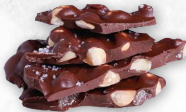
“FLEUR DE SEL” MACADEMIA MILK CHOCOLATE