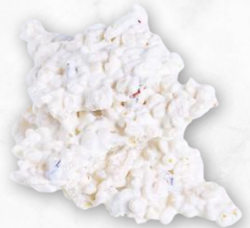
CRUNCHY GRANOLA YOGHURT CHOCOLATE