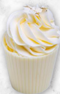
ZÉPHIR 34% WHITE CHOCOLATE MOUSSE