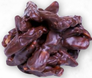
DARK SWEET ALMOND Rocher 64% "Guayaquil"