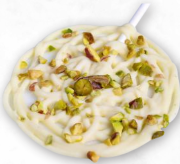
PISTACHIO WHITE CHOCOLATE