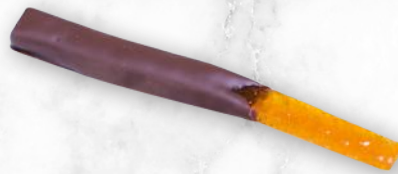
CANDIED ORANGE STICK