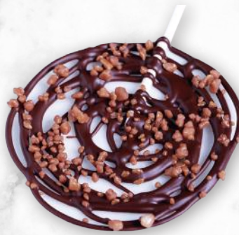
XOCOLATA DARK CHOCOLATE