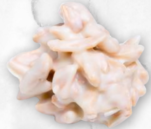
WHITE SWEET ALMOND Rocher 41% "Alunga"