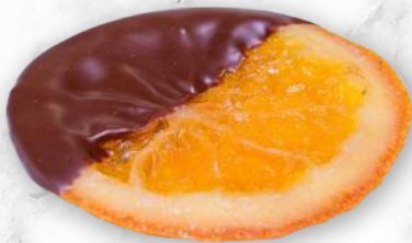
WHOLE ORANGE SLICE