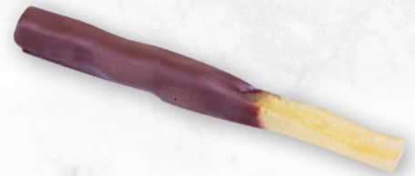
CANDIED LEMON STICK