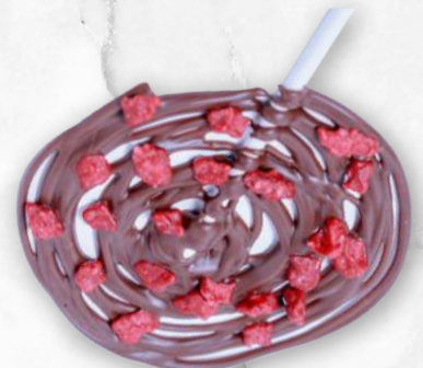
FRAMBOISE MILK CHOCOLATE