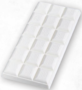
CRANBERRY YOGHURT WHITE CHOCOLATE