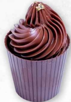
GUAYAQUIL 64% DARK CHOCOLATE MOUSSE