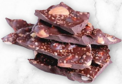
POPPING ALMOND DARK CHOCOLATE