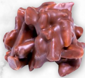
MILK SWEET ALMOND Rocher 41% "Alunga"